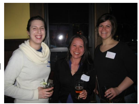
Guests networking at Pete Miller's

February— Our winter social networking event last month consisted of socializing, cocktails and appetizers in Evanston. AWIS Chicago hosted over 20 of its members and non-members to Pete Miller's Steak & Seafood restaurant's for an afternoon of networking, informal discussions and card exchanging. Representatives from academia (research institutes and community colleges), industry (large and start-ups) as well as clinical laboratory directors were present, to name a few.