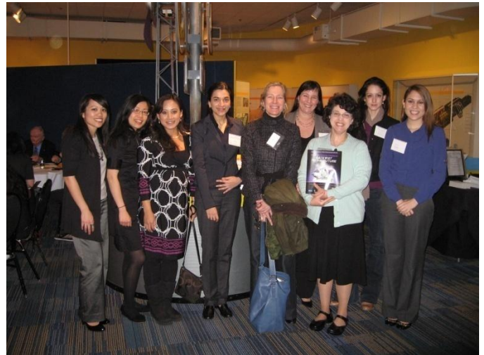
AWIS Chicago members judge at the CPS Science Fair at the Museum of Science and Industry

March – On March 25th, 2011, an enthusiastic group of AWIS–Chicago members were Special Awards judges at the 61st Chicago Public School Science Fair held at the Museum of Science and Industry. There were many excellent students this year and the top 4 students who showed the most potential in science and engineering were each given $50 and a Special Award certificate from AWIS Chicago. Runners–up were also provided certificates of recognition from our chapter. This is an annual commitment by AWIS Chicago, to help increase interest and participation of females in STEM careers. We look forward to seeing you there next year!